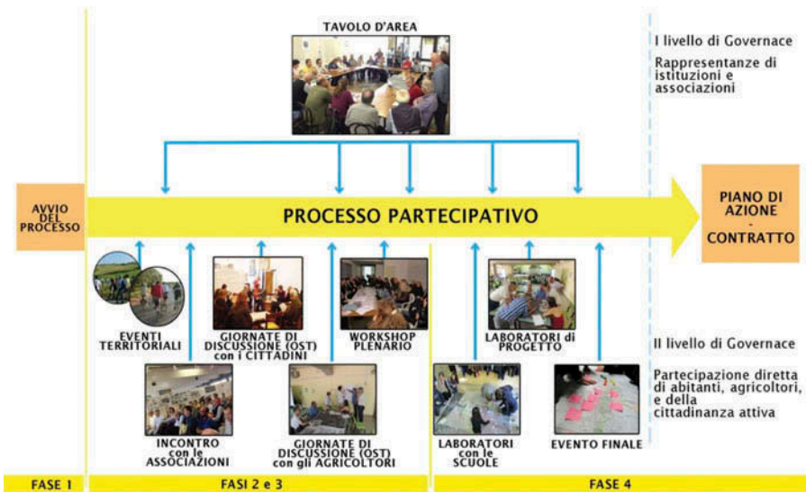
Figure 3 Structure of the participatory process.