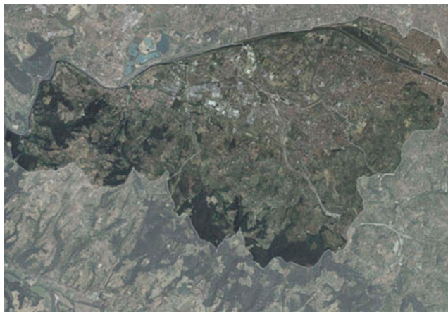
Figure 2 The project area.

Also, due to the recent economic crisis, in Western cities a demand for food safety and even self-government of food policies has continued to spread, and communities claim a key role in the organization of production/consumption chains in their territories with an appeal for food sovereignty. 2 In the United States, territories are being redesigned according to “Community food security”, understood as “a process of re-spatialization of food systems orientated around the spatial delimitations of community ” (Feagan 2007, 27). Even though not in great numbers, an